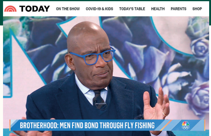
BROTHERHOOD: MEN FIND BOND THROUGH FLY FISHING

Al Roker, Nov. 15th, The Today Show 3rd Hour