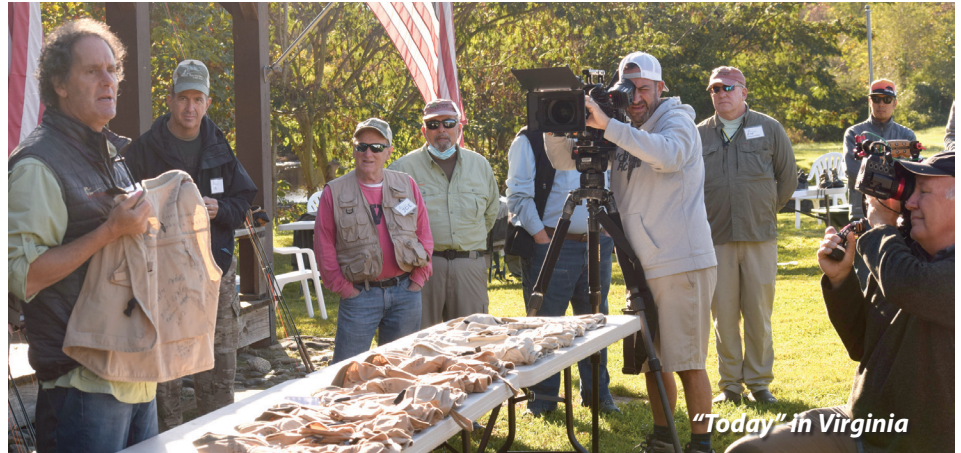
"Today" in Virginia

September 1, 2021. We're back in business! After almost two years, Washington