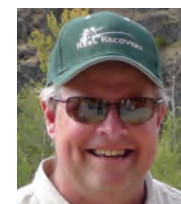
Washington Kris Kristoferson